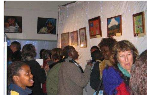
Admiring and sharing art across cultures: e.mer.gent

Two hundred people including the artists and their families attended the event with more than $1200 worth of art being sold. Thanks to the generosity of local and national funding 100% of the door sales were able to go directly to the artists in the form of art vouchers. More than 20 ethnicities were represented in the artwork from migrant and refugee backgrounds.