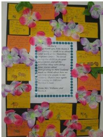
A thank you poster to Settlement Support New Zealand from Hillcrest Normal School (Hamilton)