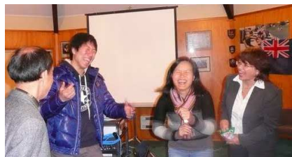
Laughter and fun playing games at the NZ Korean Friendship Meeting

On 9 July, 2009 the New Zealand Republic of Korea Friendship Society (NZROK) held its second meeting of the year. This time the programme included presentations from a new local Korean NZ Police officer, Settlement Support and community updates. Games were also shared among a group of Koreans and New Zealanders; language and cultural knowledge are regular themes used at meetings.