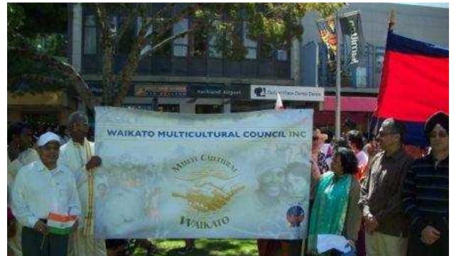
Waikato Multicultural Council Inc 'Parade of Nations' at the Indigo Festival 2010

LanguageLine is available for this service 9am-6pm.