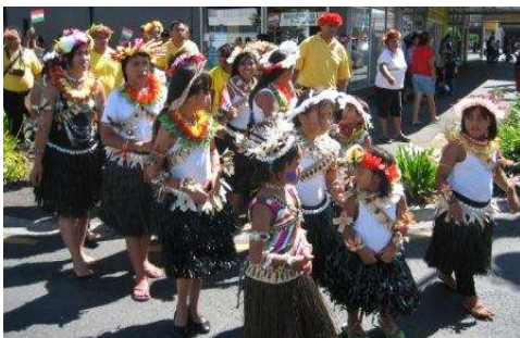
Parade of Nations 14 March, 2010

The community was invited to join the 'Gathering of Cultures' family day at the Hamilton Gardens. The action packed event offered also cultural performances, food stalls and activities for children to enjoy.